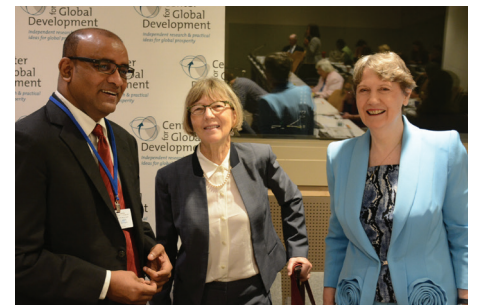
Former Guyana President Bharrat Jagdeo and UNDP Administrator Helen Clark left at a CGD event during the SDG Summit.