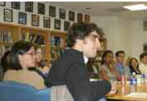
Global Development Meet-Up on Faith and Development.