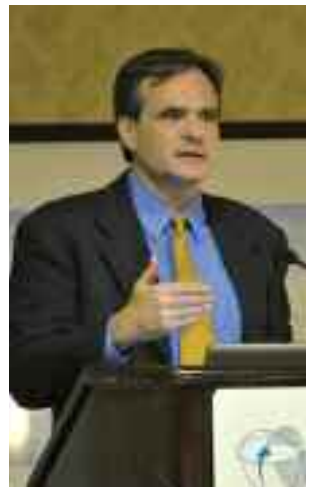
Simon Johnson, Kurtz Professor of Entrepreneurship at MIT’s Sloan School of Management and Senior Fellow at the Peterson Institute, speaks at a CGD event.