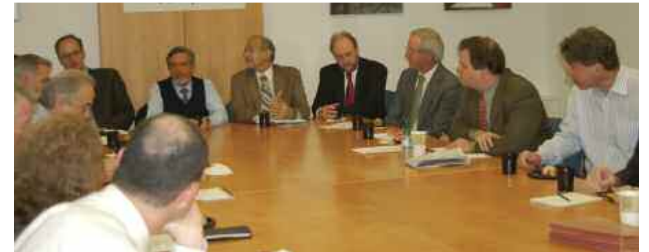
Attendees welcome incoming World Bank Chief Economist and Senior Vice President for Development Economics Justin Yifu Lin at a CGD breakfast, hosted by CGD President Nancy Birdsall.