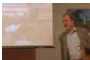
William Easterly, former CGD Visiting Fellow and Professor of Economics at New York University, discusses his book, Reinventing Foreign Aid.