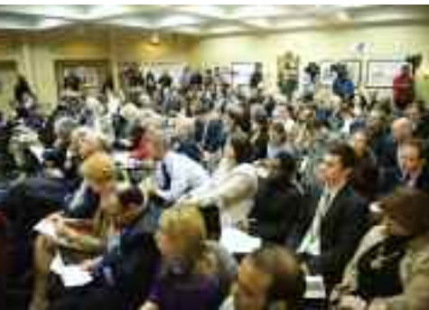
World Bank President Robert Zoellick attracted a standing-room-only crowd of over 200 to this CGD event at the Washington Hilton Embassy Row. Zoellick's speech included a proposal for sovereign wealth funds to invest one percent of their holdings in equity in sub-Saharan Africa as a way of tapping long-term global liquidity to boost investment opportunities and development.