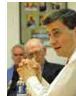
Douglas Alexander, British Secretary of State for International Development and Member of Parliament, during a private discussion at the Center for Global Development.