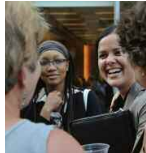
2008 Sabot Memorial Lecture attendees chat during the reception.