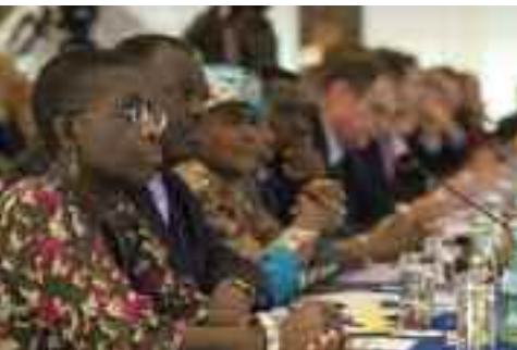
Former Liberian Minister of Finance Antoinette Sayeh, National Coordinator of the Liberia Reconstruction and Development Committee Natty B. Davis, and Liberian Minister of Foreign Affairs Olubanke King Akerele participate in the Liberia Poverty Reduction Forum 2008 in Berlin, Germany.