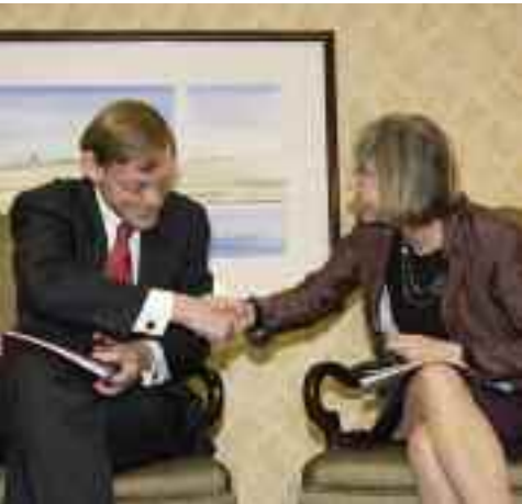
World Bank President Robert Zoellick with Nancy Birdsall at CGD event organized by ahead of the World Bank/IMF Spring Meetings. Mr. Zoellick delivered a major speech outlining new approaches the World Bank would take to help solve global problems.