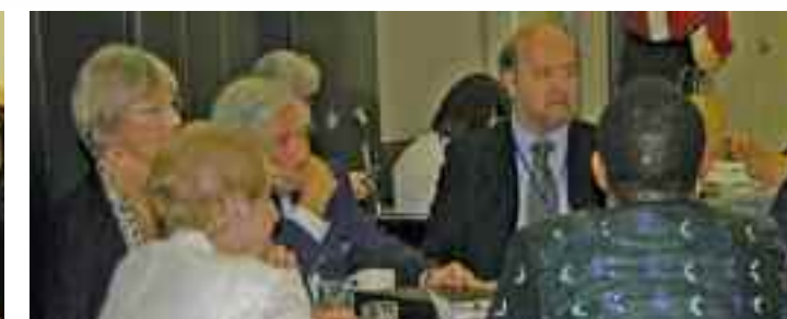
Madeleine Albright, Chair of National Democratic Institute; Nancy Birdsall, President, Center for Global Development; James Wolfensohn, former President, World Bank and Founder, Wolfensohn and Co., LLC; and Hernando de Soto, President, Institute for Liberty and Democracy discuss the role of the new administration in achieving global development goals during a candidate roundtable at the Democratic National Convention.

During the primaries, candidates from both parties vowed to address global poverty, disease and climate change. In the general election, Democratic and Republican party platforms committed to better, smarter development policies, and candidates Barack Obama and John McCain both addressed development concerns. Barack Obama was elected having promised to make the case to the American people that development "can be our best investment in increasing the common security of the entire world."