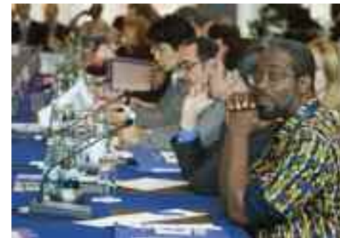
Participants convene at the Liberia Poverty Reduction Forum 2008 in Berlin.