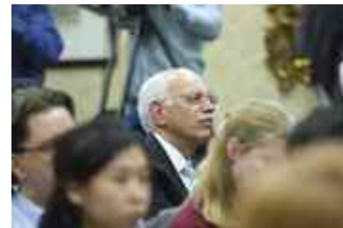
Former USAID Administrator Andrew Natsios attends a CGD event featuring an address by World Bank President Robert Zoellick.